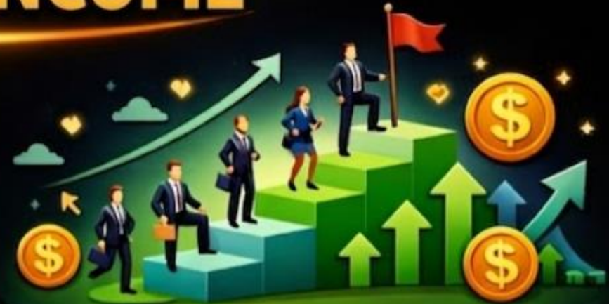
LEVEL TRADE INCOME